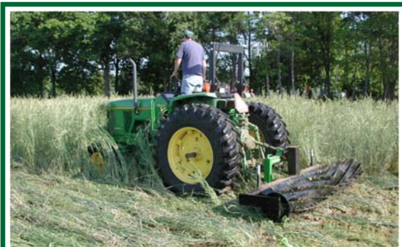
Figure 3. Roller crimping cereal rye.

dates. Examples of cover crops that have been successfully terminated using the roller crimper include cereal rye (Figure 3) and hairy vetch. Success is dependent on the stage of the cover crop, with these two species required to reach the point of flowering (Faeke's 10.5/Zadoks 60, for cereal rye). Crimping prior to flowering may result in continued growth. However, waiting until the time of flowering adds the risk that viable seed could be produced, resulting in volunteer plants emerging in the future. Utilizing the roller crimper in combination with herbicides increases the likelihood of successful termination.