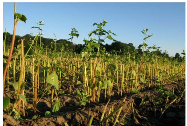
Figure 2. Flowering regrowth in buckwheat after failed termination by mowing shortly (Photo credit: Erin Hill).

In systems that include tillage, or are managed organically, mechanical soil disturbance can be a reliable method of cover crop termination. A moldboard plow is the most effective tool to manage dense stands of overwintering cover crops. Chisel plowing is also an effective method for termination of most cover crops. However, multiple passes may be required if large amounts of cover crop biomass are present. Rototillers can also terminate cover crops when biomass levels are low enough to avoid clogging. Vertical tillage tools are not reliable for cover crop termination. Mowing is also not a reliable method of terminating most cover crops (Figure 2).