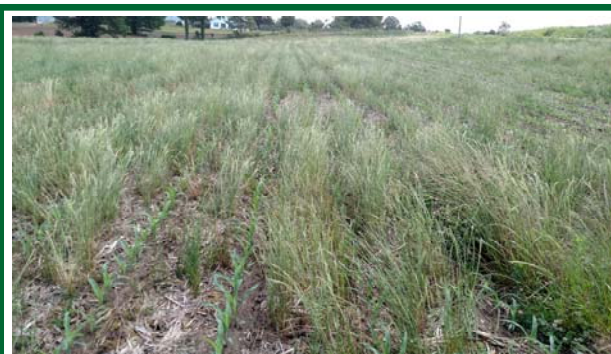
Figure 5. Failed control of annual ryegrass prior to corn planting resulting in crop competition and seed production.

Termination timing in the event another application or different method is required. Occasionally multiple herbicide applications will be required to successfully terminate a cover crop. Early termination allows for flexibility should a second application be needed.